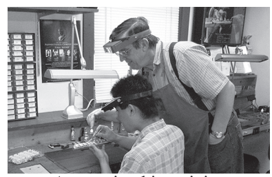
Apprenticeship training with skills of old.